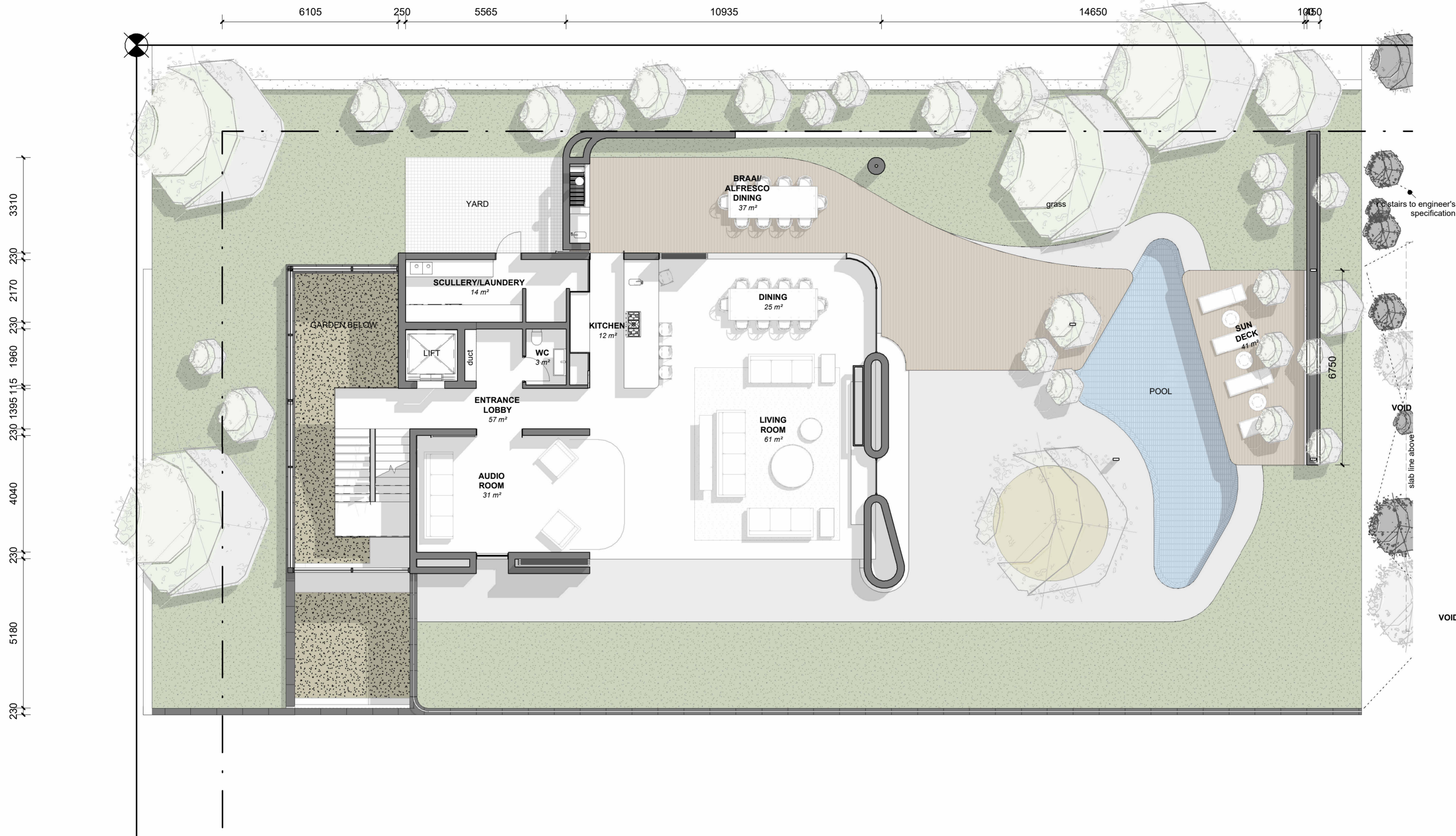
S1-02 - GROUND LEVEL SCALE 1 : 100